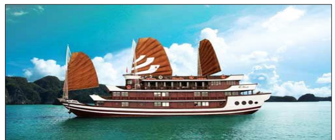
'Bhaya Classic' Cruise, Halong Bay

Arrive in Auckland at 11.50 am where you will be transferred to your home address.